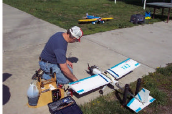
Getting Ready to Fly!

When you visit the field, you will need some basic tools as well as some specialized starting and testing equipment. You will need a way to carry your stuff. You can purchase or make a flight box. A flight box typically includes a place for a starting battery, tools and basic gear. You may also wish to consider getting a fishing tackle box. A tackle box will often have many small sealed compartments that are perfect for storing small spare parts, such as screws, wheel collars, extra glow plugs, etc. I've listed some of the tools and supplies you will probably need. This is not a complete list and as you progress, you may find the need for additional tools and equipment. Most pilots start with basic tools and slowly build up their flight gear and replace basic items with more advanced items.