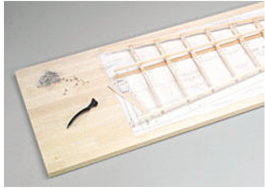
Building from a kit.

If you have the time, I strongly suggest you build from a kit. Building will give you an in-depth knowledge of the inter-workings of your plane. If you want to get into the air quickly, I'd suggest an ARF. I'd avoid most RTFs unless you are under serious time/budget constraints. I'd also be careful about bundled systems that include the plane, engine and radio. While a bundled system may offer a good savings, be sure you understand which radio and engine is included before you purchase.