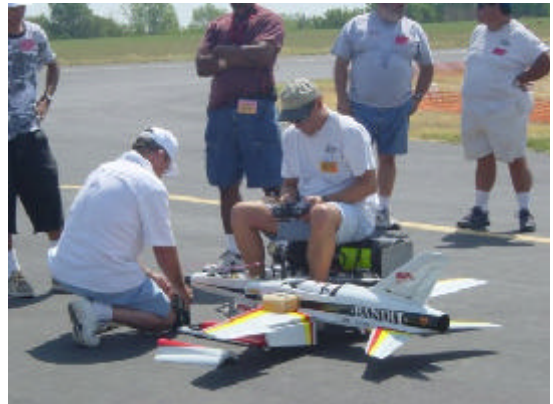
Bandit Turbine Undergoing Pre-Flight Checks.

An experienced pilot that properly performs pre-flight checks will have a ritual they perform before each flight. Watch an experienced pilot and notice how they check their plane before every flight. To start, you may wish to write down your pre-flight checklist. Eventually, you will automatically perform the pre-flight checks without the need for the list.