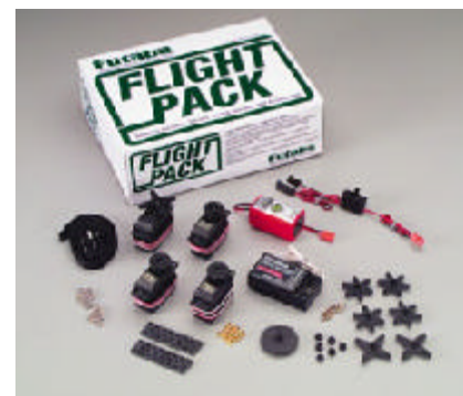
Typical Radio Kit included with Transmitter

You will need a radio designed for model aircraft. It should be on the 72MHz FM band and clearly marked for aircraft use. Don't buy a surface (car/boat) radio as these are not legal for aircraft use. Most entry level radios are sold as complete sets. They will include a transmitter, receiver, batteries, battery chargers, a power switch, wiring and servos... everything you need to get started. With a radio set, the transmitter and receiver will be matched on one of the 50 available aircraft frequencies, numbered 11 thru 60. Don't worry too much about which frequency channel you purchase. But, you may wish to ask which frequency channels are used most