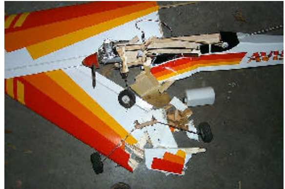
Oh! I can't bear to look at this.

How often do planes crash? Shhhh... don't say that word. OK, yes, the planes can and will crash. 99% of all crashes are due to improper maintenance and/or pilot error. With proper instruction, good maintenance, and flying lessons given by experienced LSK members, your chances of having a serious crash during instruction and training are very small. After you learn the proper procedures and skills, you can have hundreds or even thousands of solo flights without a major crash.