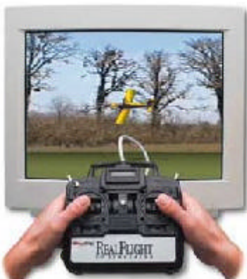
A popular Flight Simulator

pointers in the Basic Building, Setup and Flight section of this guide. I would however like to stress that the included tips in no way substitute for an instructor. In addition to field instruction, consider getting a flight simulator. There are several computer programs for the PC that simulate RC flight. These range in features as well as price, but most start around $200. I realize this sounds like a lot, but consider the following. One of the keys to learning to fly RC planes is stick time. A simulator is an excellent practice tool that can be used night or day, regardless of weather. As you become more experienced, the simulator will also be a good tool for learning harder more complex maneuvers. If the simulator prevents just one crash, your money ahead.