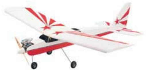
Typical Glow Trainer - GP 40 ARF Shown

You need a trainer. Trainers are inherently designed for the sole purpose of teaching the fundamentals of flying. Trainers offer stability often not found in other planes. Basically everyone learned how to fly with a trainer. If you are unsure of which planes qualify as a trainer, ask an experienced pilot.