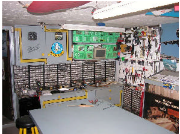
A Typical Model Builder's Workshop

Even if you purchase an assembled RTF, you will need some basic building tools at some point. I've listed some of the tools and supplies you will probably need. This is not a complete list and as you progress, you may find the need for additional tools. Most pilots build up their shops slowly over time as they determine which items they need on a regular basis.