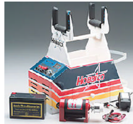
Flight Box with Starting Equipment.