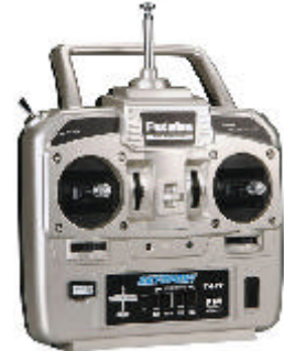
4-Channel Non-Computer Transmitter