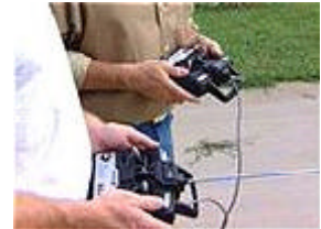
“Buddy Boxed” radios