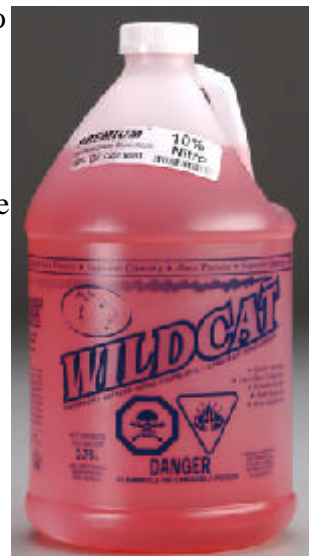
Glow Engine Fuel

Consider looking at the better and larger sport 2-stroke engines. Some engines use bushings instead of bearings. Better engines typically use bearings. Why look at bigger and better engines? Your second plane of course! Purchasing a good engine for your trainer means you can use your trainer engine in your second plane! For the 40 sized trainer example I listed here, my suggestion is to use a bearing 0.46 2-stroke, such as an OS-46FX. If you are under budget constraints, I'd suggest a slightly smaller bushed engine, such as the OS-40LA. Kits and ARFs leave the engine selection to you. A RTF will include an engine.