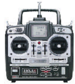
6-Channel Computer Transmitter

Radios can be designed for sailplanes, powered planes, helicopters, or a combination of any of the above three. This is particularly true with computer radios. Some radios will only contain software for one craft type, while others may contain software for all three. While it is technically possible to program an aircraft radio for helicopter use and vice versa, it is much easier if the proper software is available in the radio. So, if you think you may wish to try your hand at a heli someday, consider getting a radio that supports both planes and helis.