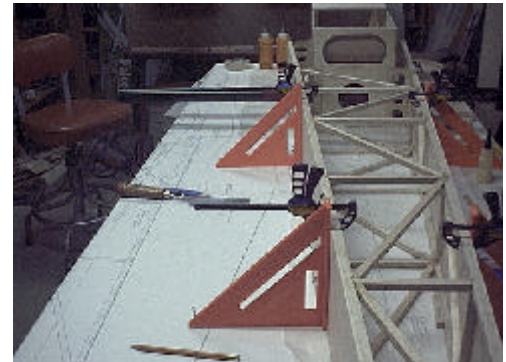
Straight and True Models Fly Better