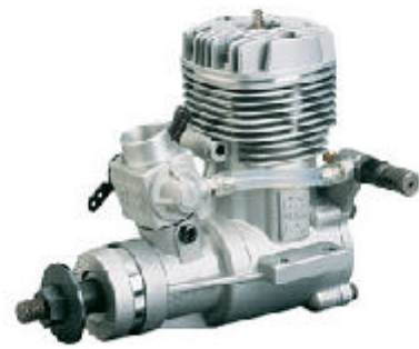
Typical Glow Engine - OS46FX Shown

RC Trainers are available with various motor types, from no motor (glider) to electric and glow power. The most common motor types are glow, but electrics are becoming more popular as battery technology advances. Electric motors tend to have higher initial costs as you must buy all of your fuel (battery) up front, but electrics do offer a quieter and less messy flight. If you are interested in electrics, ask around to locate experienced pilots familiar with electric planes. Glow engines offer the most bang for your buck and are the most common model aircraft engine type.