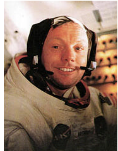
Neil Armstrong - Model Pilot

Who are model pilots? RC model aviation has no gender or age limits. LSK has both gentleman and lady pilots as well as pilots of all ages, from preteen to young at heart. Pilots as young as five years of age are not unheard of, and it is never too late to enjoy our hobby. Model aviation provides a pleasurable past time and social atmosphere. Model aviation has also been fundamental in providing early interest for the engineers and pilots responsible for the space and aviation industry today. Famous persons such as the Wright Brothers and Neil Armstrong owe their early interest in space and aviation to model aircraft.