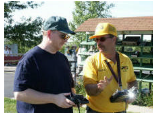
Learning to Fly is Fun!

Your top priority is to locate an instructor. There are many experienced LSK pilots that are willing to help you learn how to fly. There are a few pilots that managed to solo without the aid of an instructor, but most will tell you that if they had it to do over again, they would have found an instructor. Your instructor should take you through the basics of model flight, from safety concerns to takeoffs, flying around and landing. Everyone learns thru different methods and at different speeds. If you are uncomfortable with your instructors methods, don't hesitate to locate another instructor. I have included some