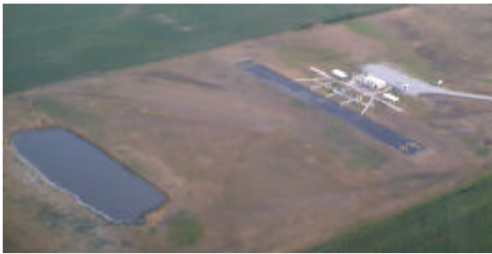
The LSK Flying Site

What weather can I fly in? The perfect day is sunny, no wind and 80 degrees. Unfortunately that never happens in Nebraska. In general, planes can be flown year round, day or night, regardless of weather. However, as a rule of thumb you should avoid wet conditions as moisture can get inside your transmitter and short out the radio. Winds don't prevent flying, but high winds can make flying more difficult. In general, beginners should avoid winds over 15 MPH (most days, the wind is below 15MPH.) Temperature also isn't a major factor, but extreme heat/cold does make flying uncomfortable for the pilot.